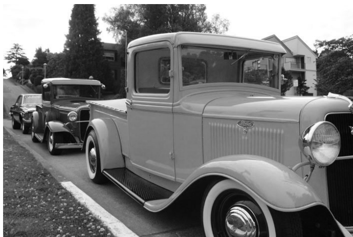
Hot rods lined up in front of event held at Magnolia United Church of Christ.