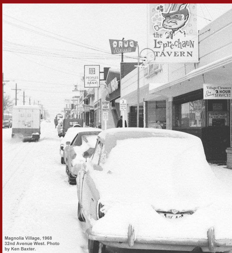
Magnolia Village, 1968 32nd Avenue West.